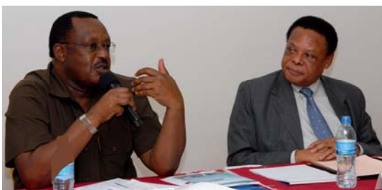
Hon. Eriya Kategaya, First Deputy Prime Minister and Minister for East African Community Affairs and Juma Mwapachu, Secretary-General, East African Community

The conversation examined how to have growth with equity and respect for human rights. It looked at how to ensure governments take up their responsibility while encouraging local business given the political insecurity of the region and uncertainty of global aid in the current financial climate.